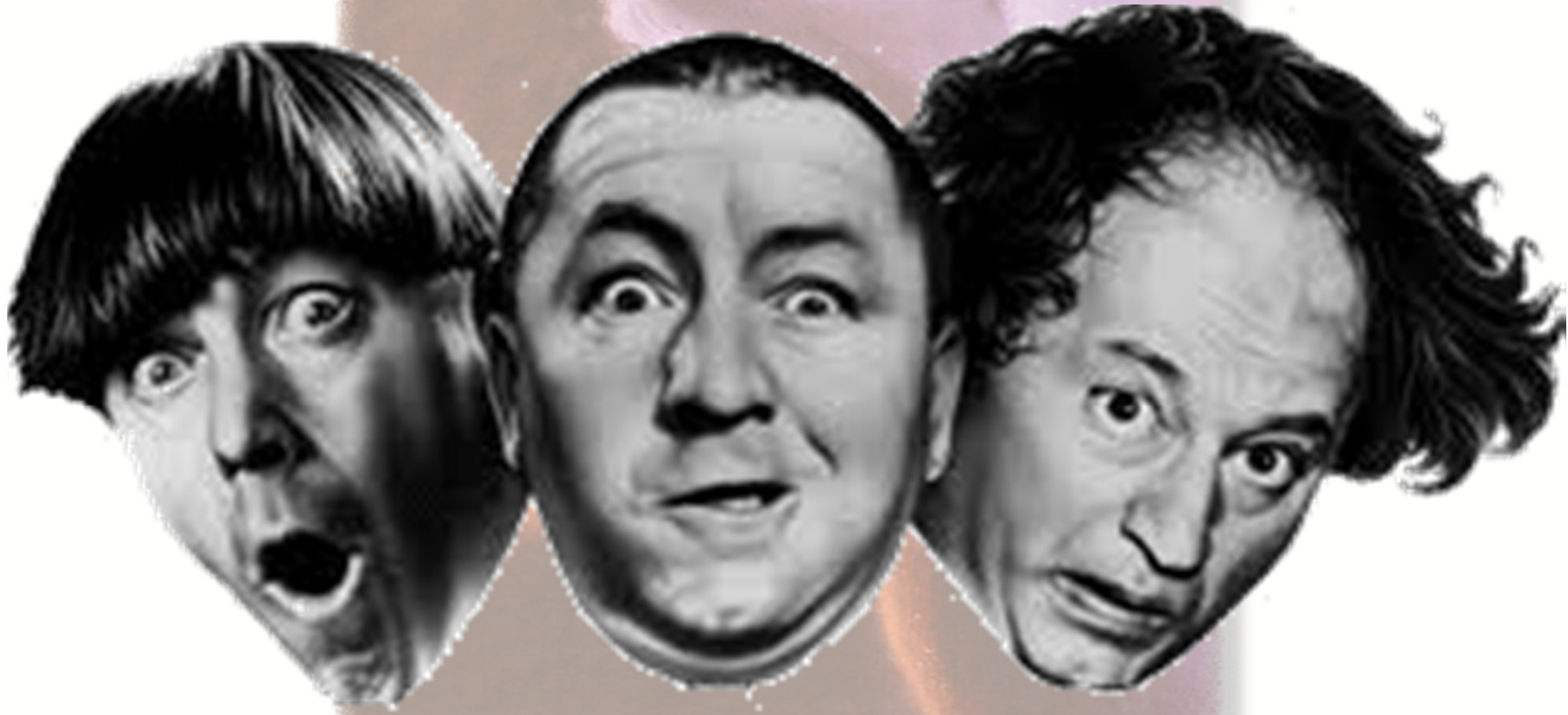
Moe-phar the Naamathite